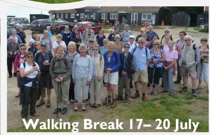
Walking Break 17- 20 July

For more info ie. Booking forms on the Golf and Walking Breaks @Sizewell