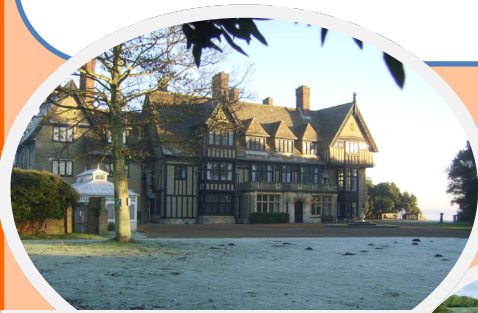
Golf Break 15-17 May 2012