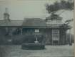
Sizewell Hall in 1859